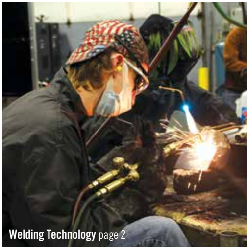
Welding Technology page 2