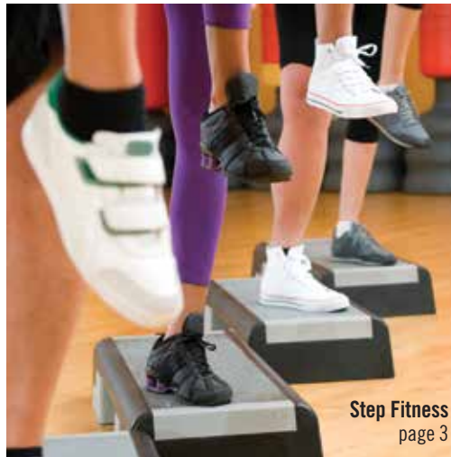
Step Fitness page 3