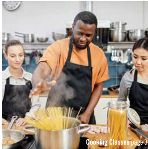
Cooking Classes page 3

USE THIS QR CODE for class dates, times, fees, and more information. Enroll today—classes fill up quickly!