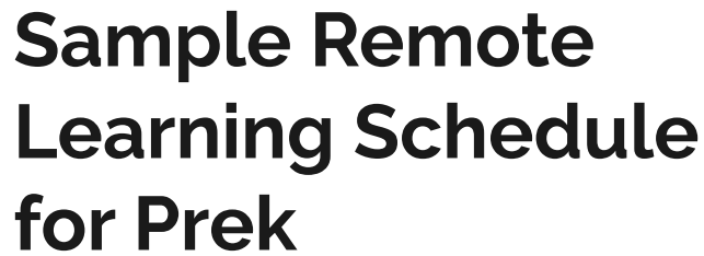
Sample Remote Schedule Pre-Kindergarten/Kindergarten (Half-day Model)