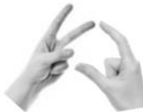
Make Good Decisions