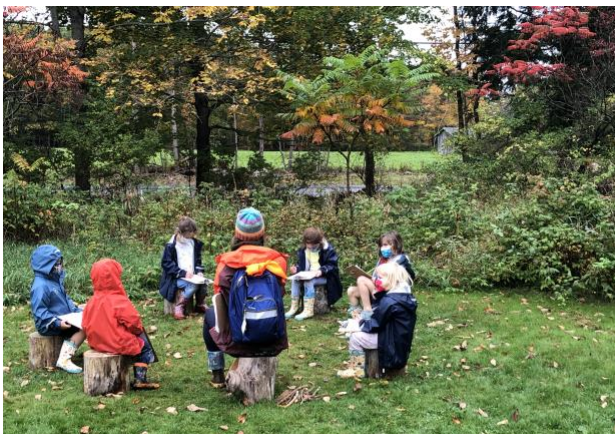
Searching for sight words and playing music with Kindergarten at HES

Classrooms: The last few weeks have been busy with visits to PreK-2 classes at all three schools! I was able to read with the students, play math games, work on art projects, play music and had lots of fun with the parachute in PE! Research tells us that predictable routines and engaging content provide our students with high quality educational experiences, and I am so proud to say that our administrators, staff and teachers are focused on student well-being and academic success. The students are engaged and engaging! I will be visiting grades 3-5 over the next few months.